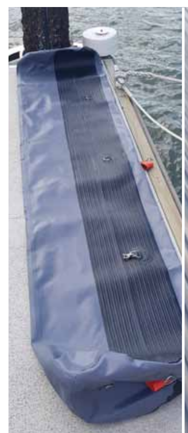
Unpack Fender. Lay fender flat, D - Ring side up with rings facing towards the boat.