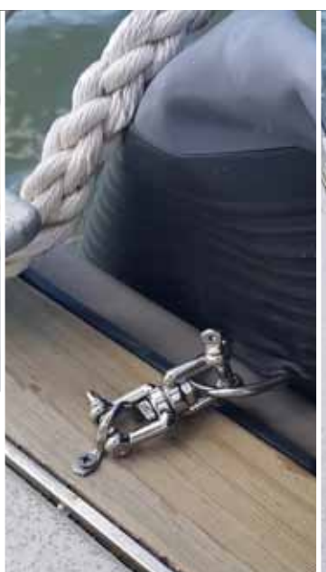
Fixing kits. For Protector and Slimline fenders are sold separately. 1 x set per fender.