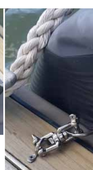
Secure fender. For safety with rope and tie to dock side.