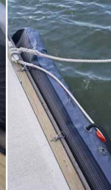
Fixing points. 3000 mm Protector fenders have 5 x fixing points (2 x being spare).

Unscrew one shackle pin. Roll over the side and Inflate. Hold the D - Ring and Foot pump to firm. connect to the shackle.